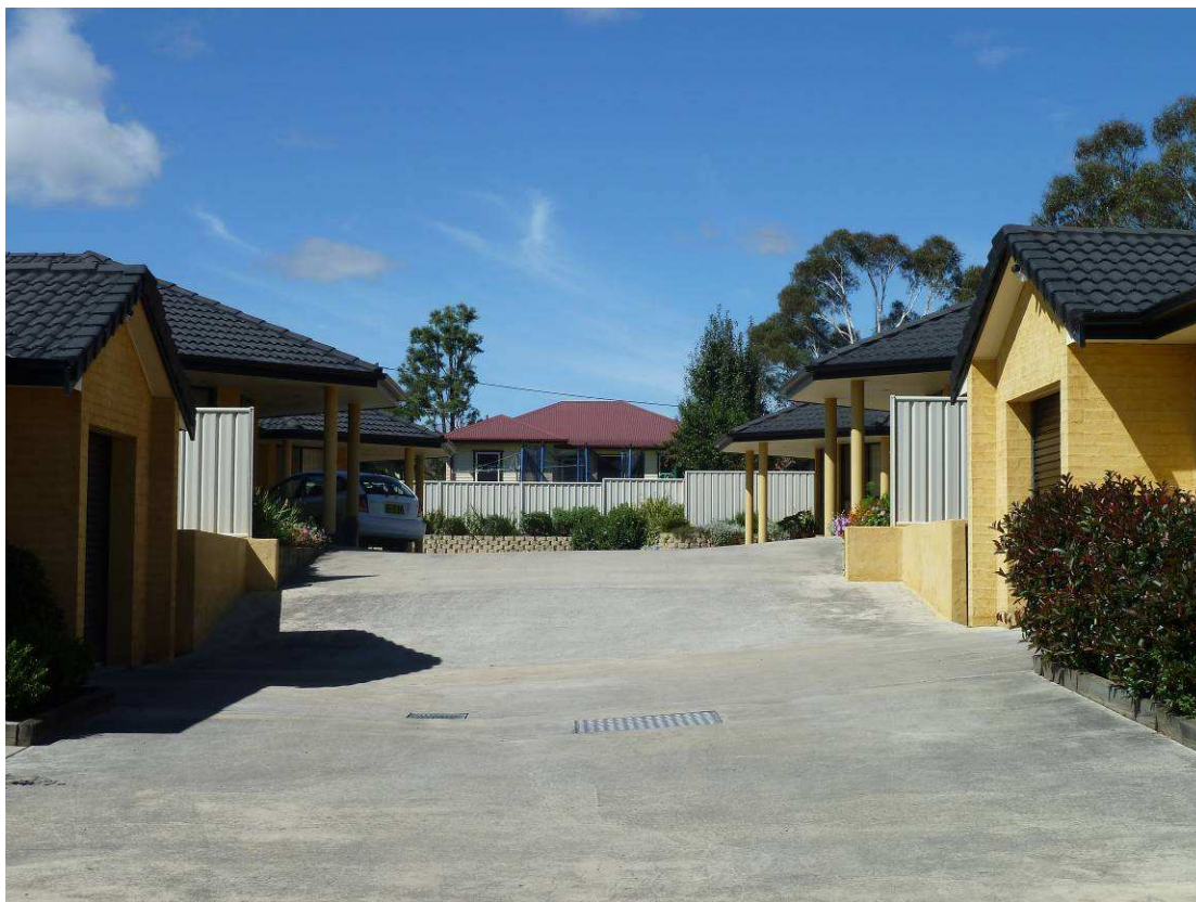
View of rear of site taken from frontage of 230 Rusden Street (existing house at 1 Claverie Street with red roof in background)