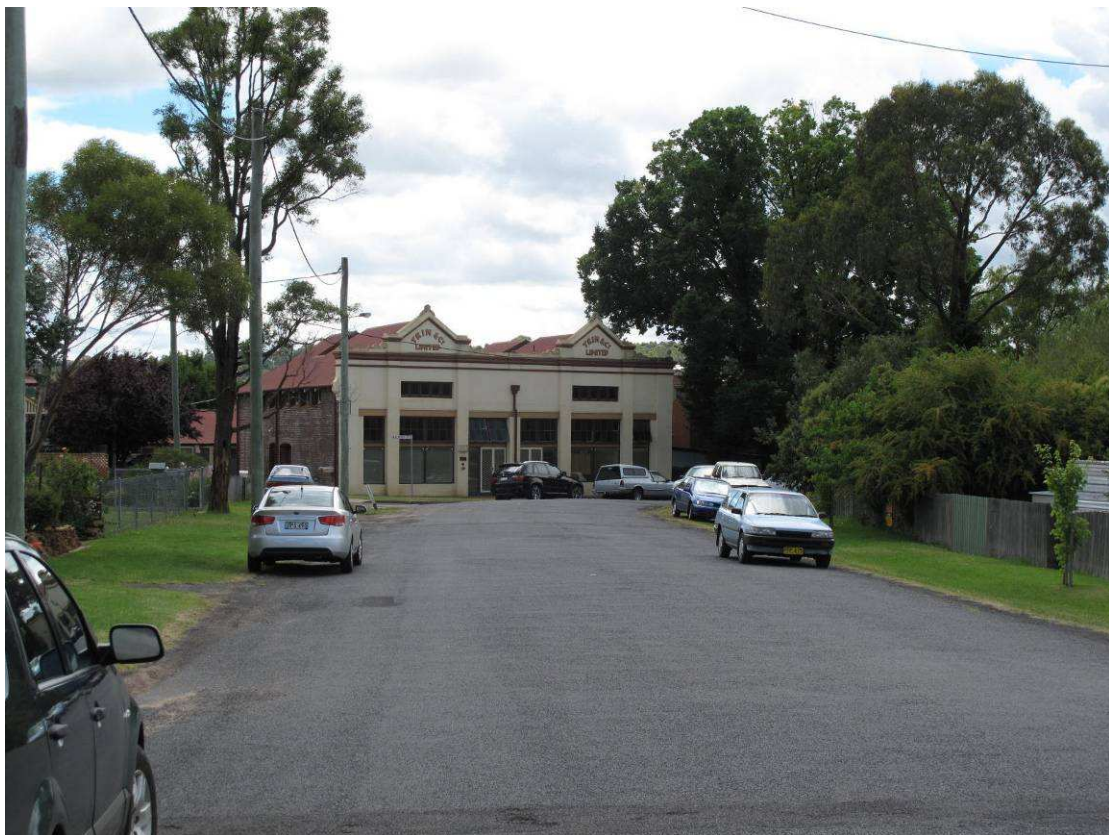
Trim's Store – significant view from Crescent / Barney Street