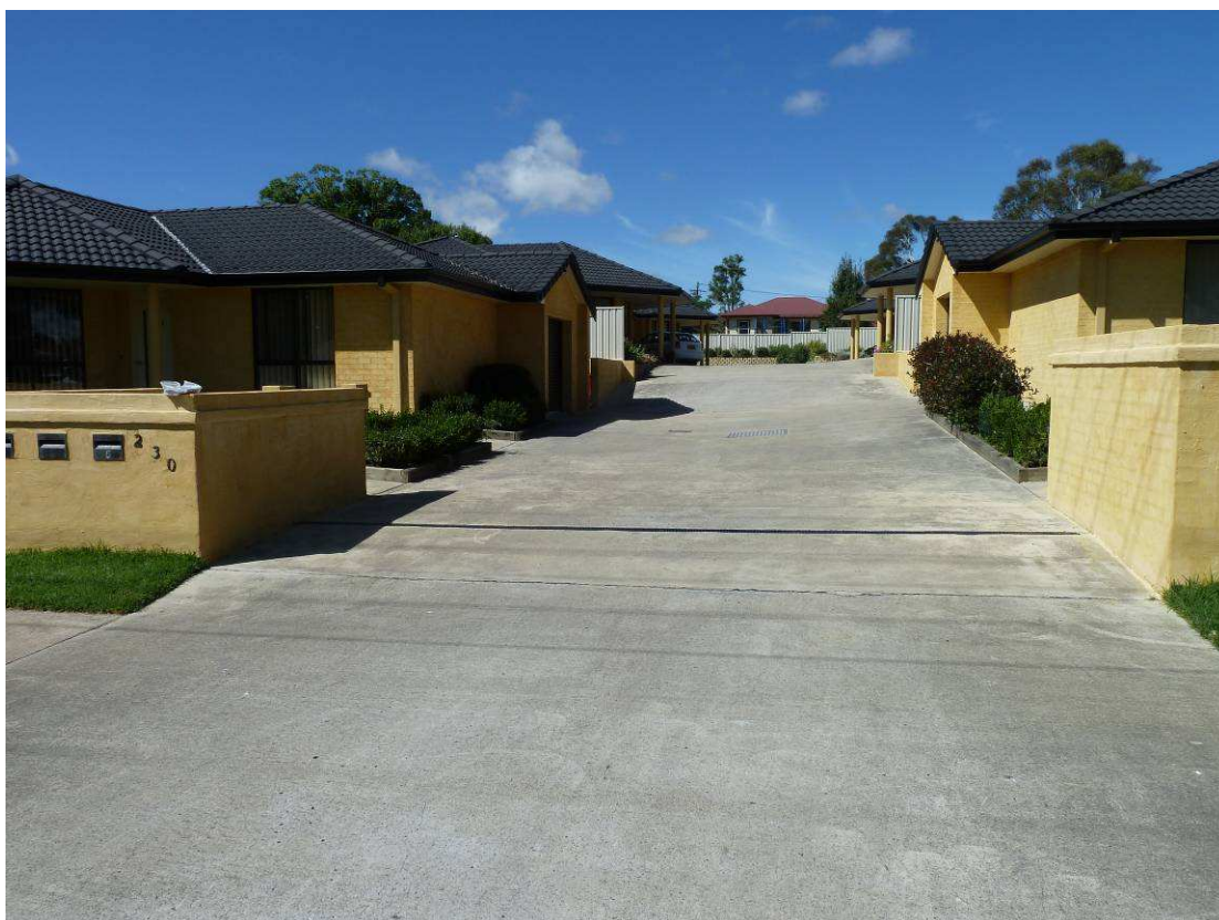
Adjacent Villa development to north of site, 230 Rusden Street