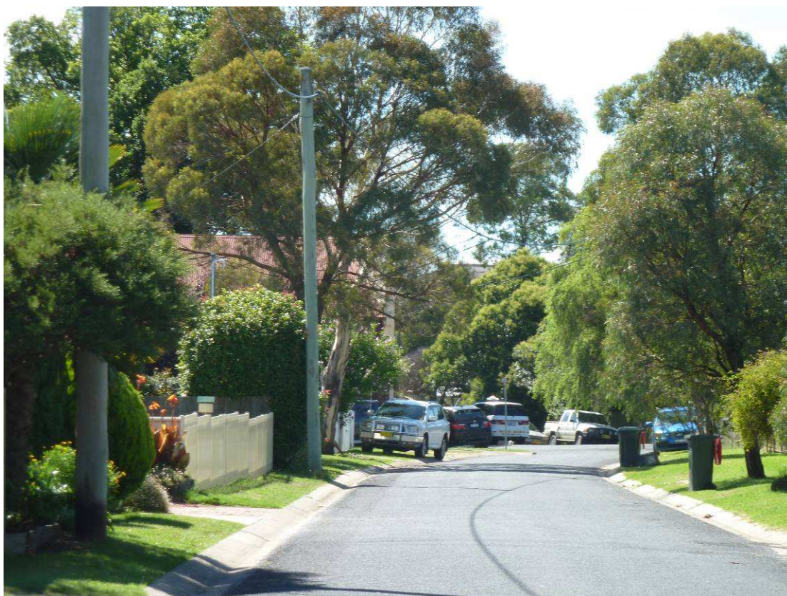
Claverie Street looking east, taken from west of the site, Trim's Store building visible through trees