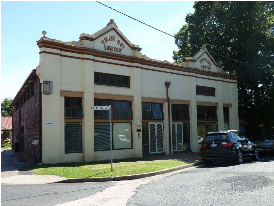
Freeman House - Trim's Store (now offices and amenities)