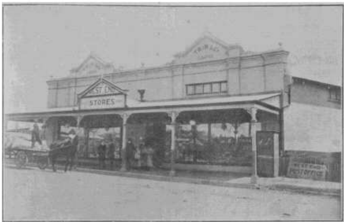
Trim's Store – photo c.1911