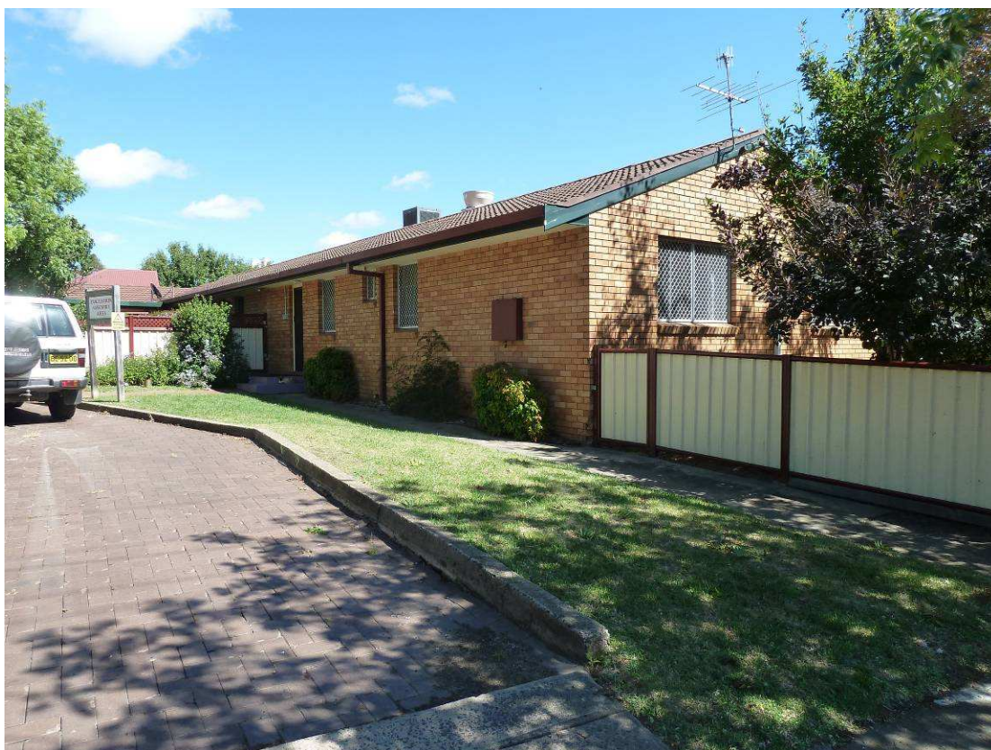
Freeman House - Amenities and Dining Building off O'Dell Street