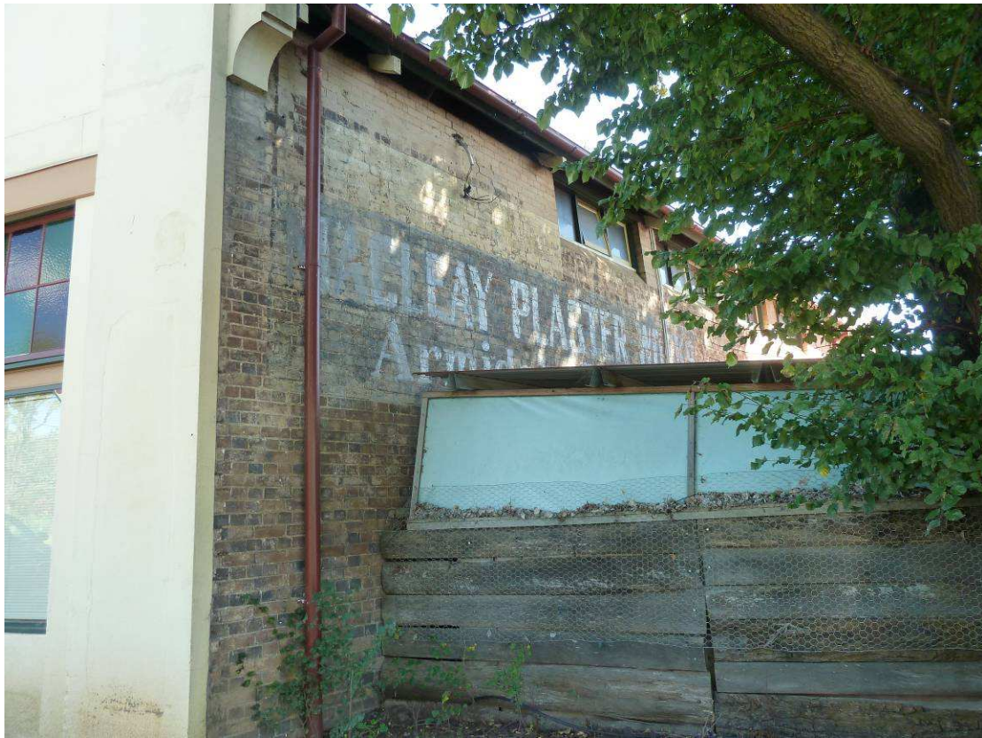
Old signage on East elevation of Trim's Store