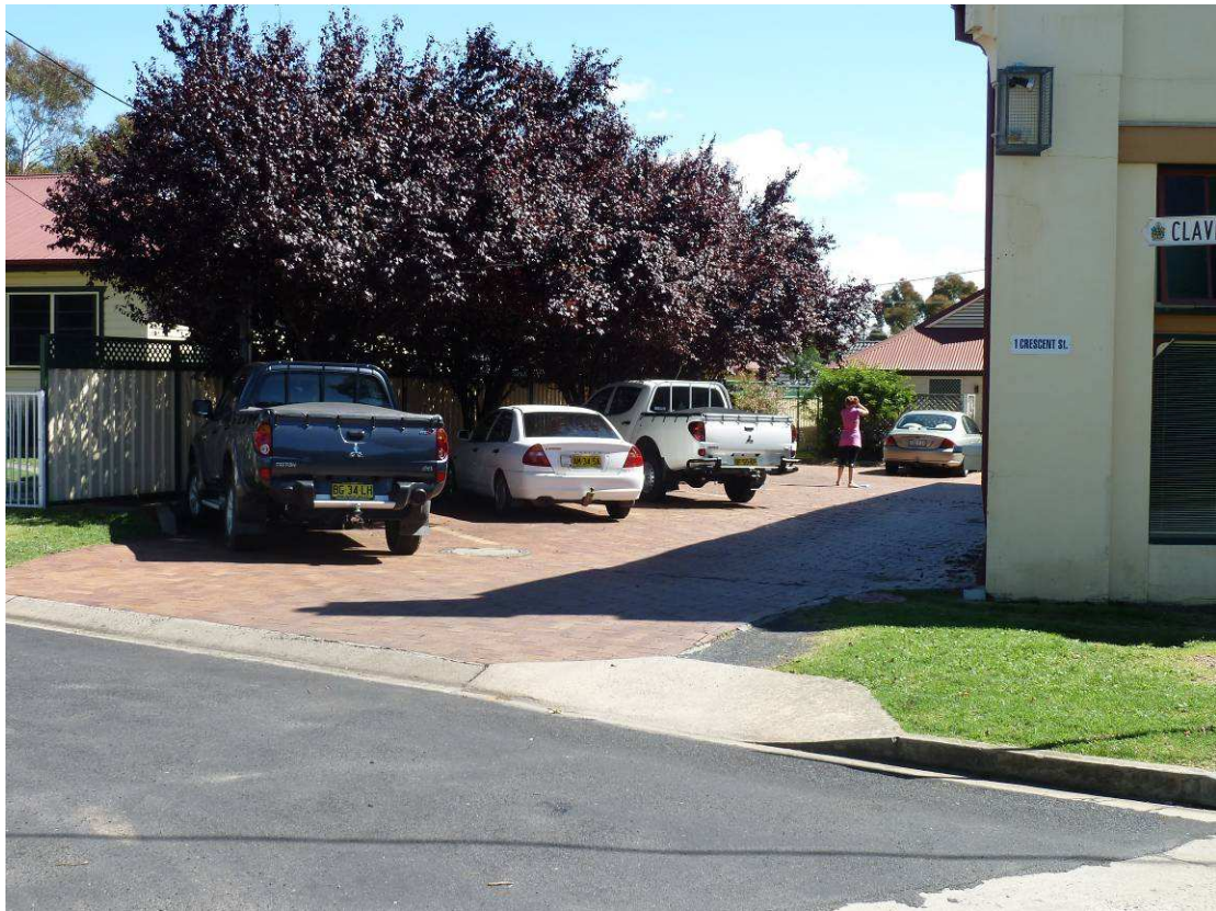
Freeman House – 7 space off street parking adjoining Trim's Store off Claverie Street