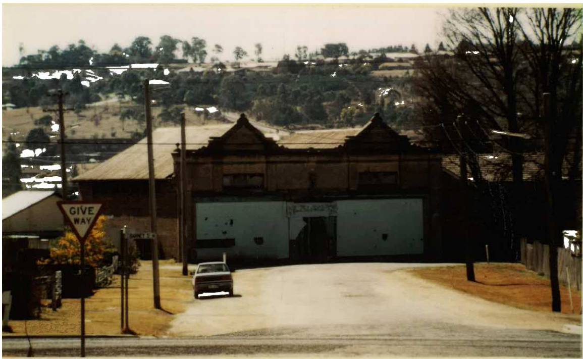
View looking north in Crescent Street, 1991 (S Gow)