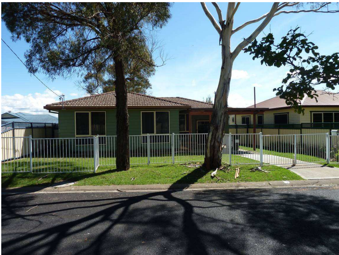
3 Claverie Street