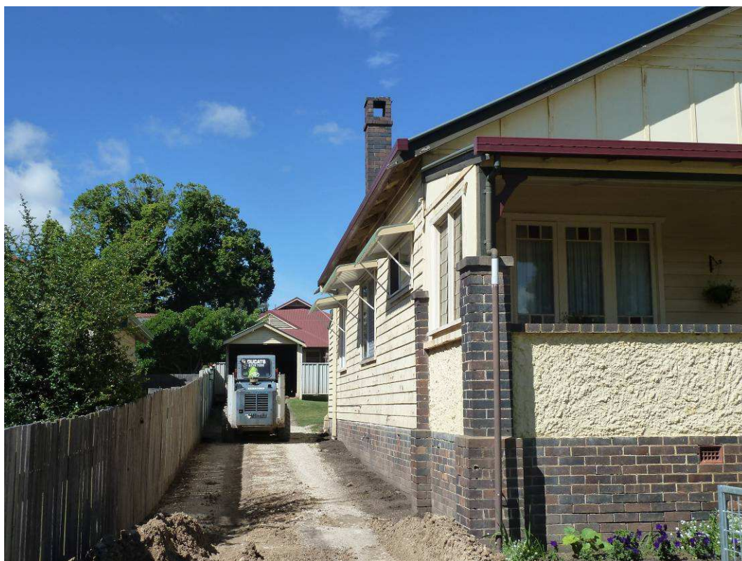
View of rear of site from frontage to 228 Rusden Street (existing transitional unit with red roof in background)