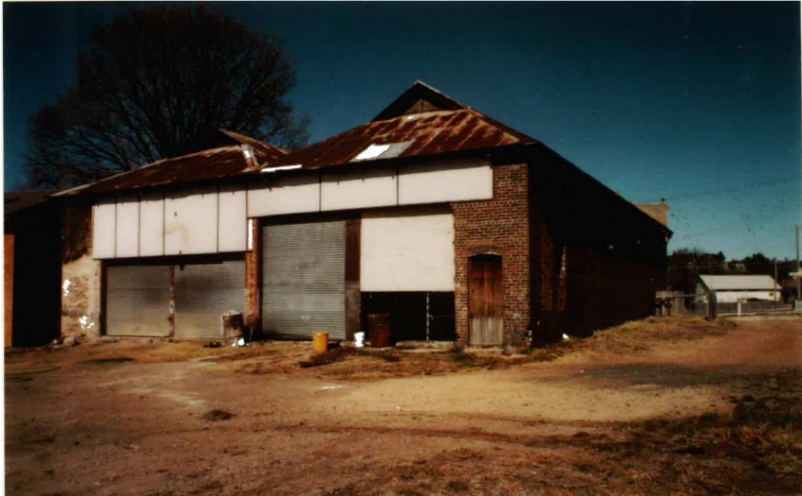
Trim's Store: View north elevation of building in 1991 (S Gow)