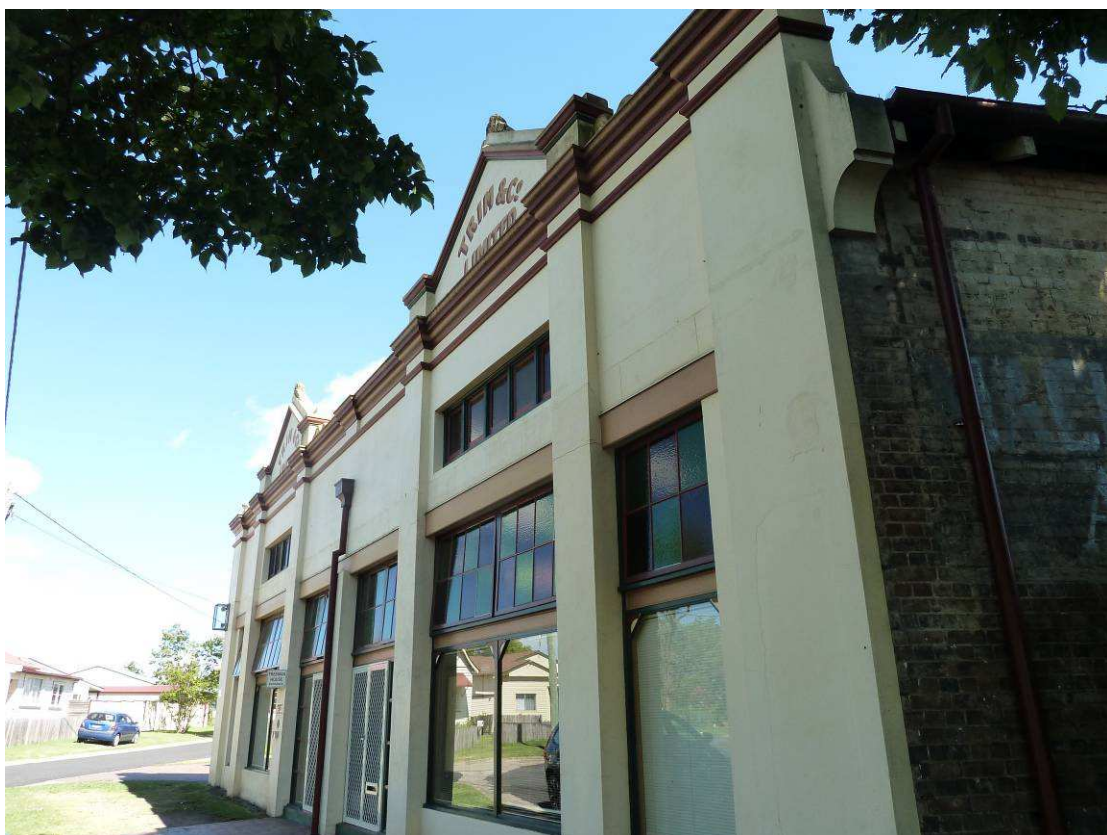
Trim's Store façade