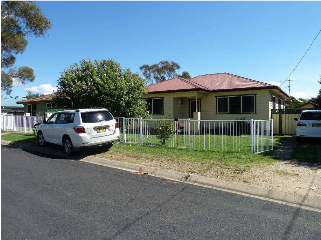
1 Claverie Street