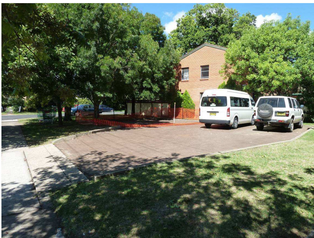
Freeman House - O'Dell Street car parking