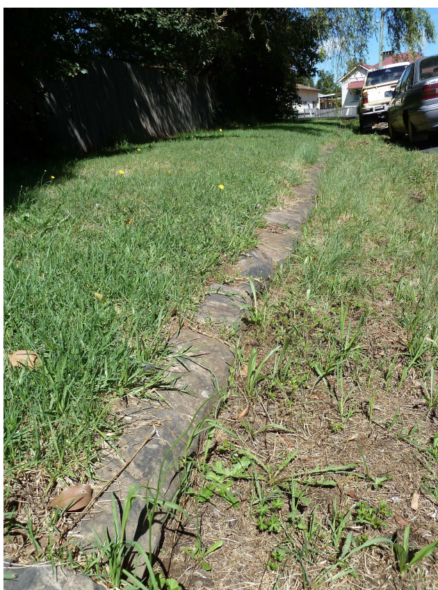
Old stone kerbing, Crescent Street (north) adjoining site